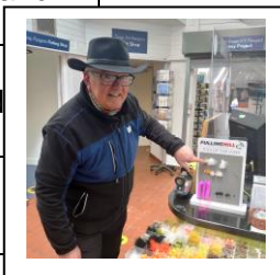
Paul's fly of the week - Bibio hopper.